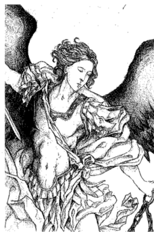
Confrérie St Michel

Fridays, 8:00 P.M., in the "Yellow Room" of the lower church.. Cultural Celebration First Sunday of each month.