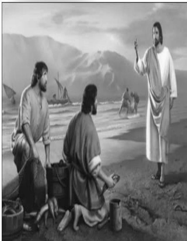
The Calling of the First Disciples Matthew 4:12-23

Parish Email: stannesbrentwood@gmail.com