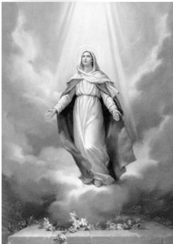
THE FEAST OF THE ASSUMPTION OF MARY Wednesday, August 15, 2018

Parish Email: stannesbrentwood@gmail.com