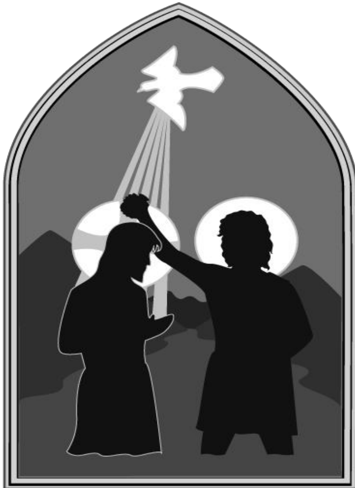
The Baptism of the Lord