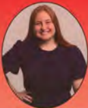
PENELOPE ROSE STUDENTS FOR LIFE