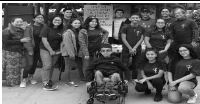
St Anne's Teen Youth Group conducting Random Acts of Kindness Day Sunday Sept 23 outside the church.

Please call the Prayer Center at (631) 730-6210 if you are interested in attending this daytime class.